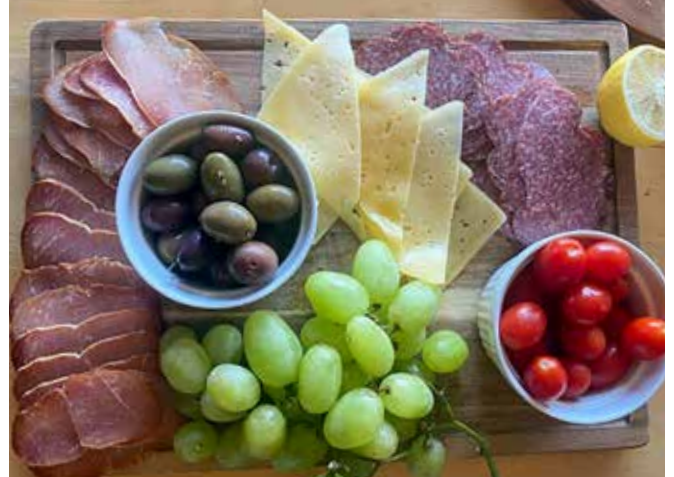
Charcuterie Board Eastern Europe Focused from European Food Store in Lynnwood Washington