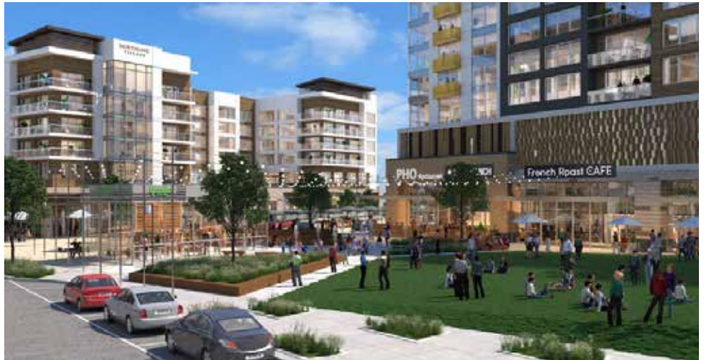
Northline Village Rendering

As part of the Urban Land Institute National Study Visit, one recommendation identifies that stakeholders need a unified message of the City Center's future. This project will support that effort including graphics, outreach, and storytelling of the neighborhood's brand. A successful product will include adoption and use of neighborhood branding by both public and private organizations located in City Center.