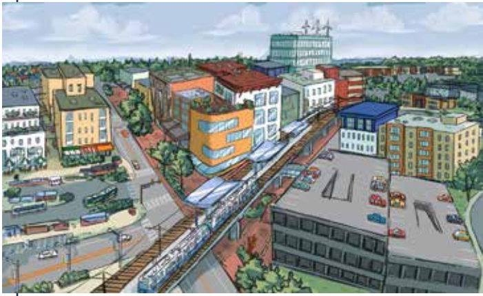
Future Lynnwood City Center

The future downtown of Lynnwood, known as City Center, has welcomed new neighbors and infrastructure upgrades over the last year. The progress made in 2022 will continue over the next few years as we anticipate Link light rail's opening bringing new businesses and housing options to the area.