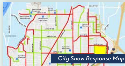
City Snow Response Map