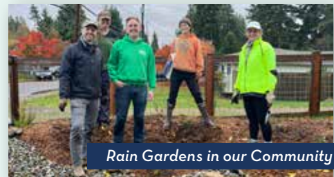
Rain Gardens in our Community