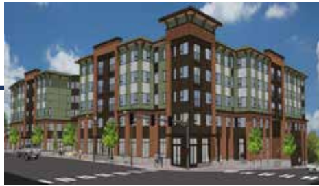
Renderings of Triton Court (above) and Edmonds Community College's SET Building—Science, Engineering and Technology (right).