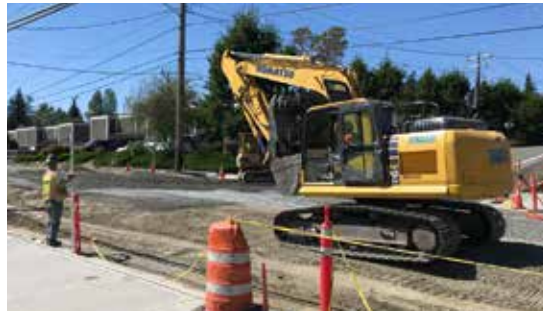
Work is progressing on the Interurban Trail Missing Link Project. This project connects a missing section of the Interurban Trail, adds new sewer lines, and sidewalks with ADA ramps.