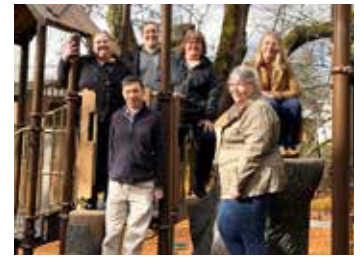
Lynnwood's History & Heritage Board visit the new playground at Heritage Park

On April 23, the City marked its 60th anniversary of incorporation with a celebration at Heritage Park that included a ribbon cutting for the new playground funded by a generous donation from the Elizabeth Ruth Wallace Living Trust. Heritage Park celebrates the agricultural, transportation and social heritage of Lynnwood from its roots in the rural community of Alderwood Manor formed in 1919. Heritage exhibits throughout the park tell stories of life in early Alderwood Manor, and its historic structures have been renovated and repurposed as community resource facilities. Currently on display through the remainder of 2019, is an 9-panel historical timeline of Lynnwood's incorporated history. The timeline is open for viewing in the Wickers Building on Tuesdays, Thursdays and Saturdays between 9am-3pm.