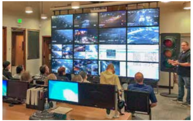
Above: Lynnwood University students tour the Traffic Management Center

For more info, or to register for Lynnwood University visit www.LynnwoodWA.gov/LynnwoodUniversity or call 425-670-5023