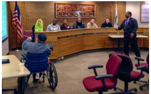
Below: Lynnwood University students participate in a mock City Council meeting with a discussion of budgeting priorities