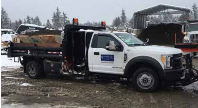
Lynnwood's fleet of sander/deicer trucks and snow plows were very busy during the February 2019 winter storm.