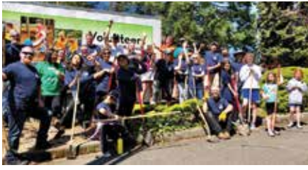
A group of dedicated volunteers joined us for Clean and Green, a cleanup project at South Lynnwood Park, to remove invasive plants and weeds and readying the park for renovation.