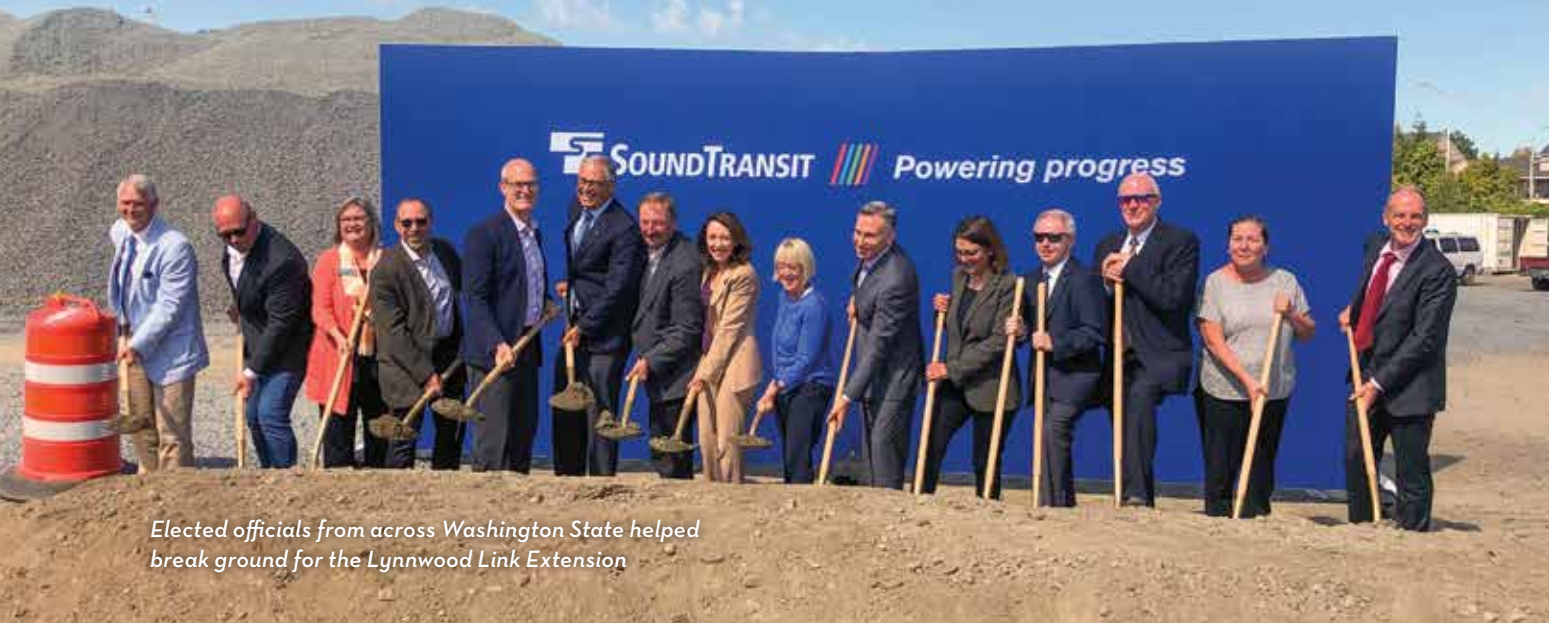
Elected officials from across Washington State helped break ground for the Lynnwood Link Extension

During construction we'll be posting regular project updates on our City website, Lynnwood eNews and Twitter. Sign up for Lynnwood eNews at www.LynnwoodWA.gov/eNews , follow us on Twitter @LynnwoodStreets and @Lynnwood, and visit www.LynnwoodWA.gov/MajorProjects