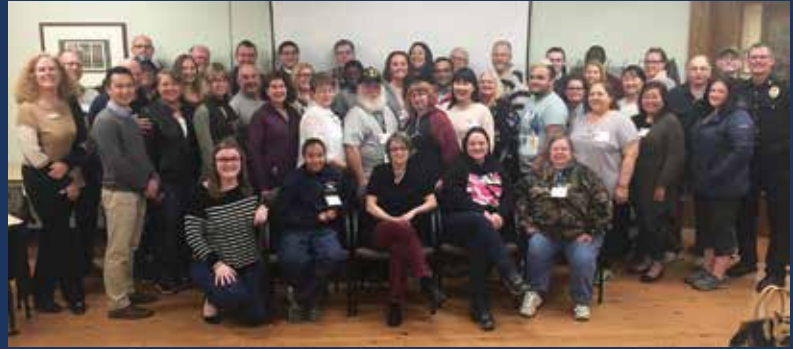
2019 Citizens Academy Participants

This is a great opportunity for those interested in the fascinating field of criminal justice, current trends in criminal activity, personal safety, crime prevention, and volunteering with our agency.