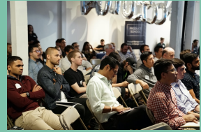
Listening Sessions: facilitating discussions to gather information on a group experience