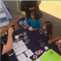
Kids Activities: coordinated activities to inspire youth participation