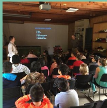
Briefings: short meetings to provide information and instruction