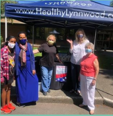
Fairs and Festivals: in-person community outreach at local events