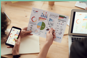
Fact Sheet: providing to-the-point information about the issue at hand