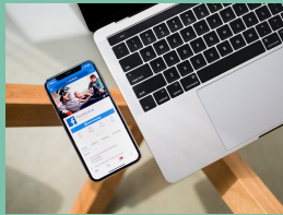
Social Media Campaigns: utilizing various digital platforms to promote engagement