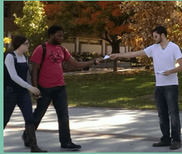
Flyering: handing out project brochures or flyers to help get walkers involved