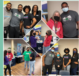
Open Houses: allowing the public to see progress up close