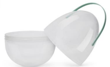
Plastic Egg Form - Halves Open Handle can be removed

SUBJECT MATTER: Eggs will be shown in public spaces visited by people of many cultures, nationalities, and ages. We reserve the right to not exhibit work that we deem unsuitable for the public space (for example, works that contain nudity, or inappropriate language).