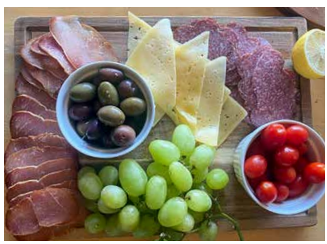
Charcuterie Board Eastern Europe Focused from European Food Store in Lynnwood Washington