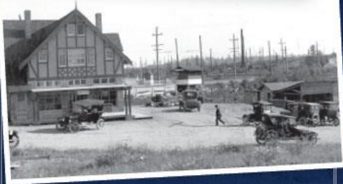
Top: The last remaining car from the Seattle to Everett Interurban Railway, Car 55, serves as the centerpiece of Heritage Park.