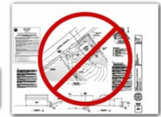
Incorrect sheet size, scale, or margins will not be accepted.