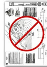
Incorrect orientation will not be accepted.