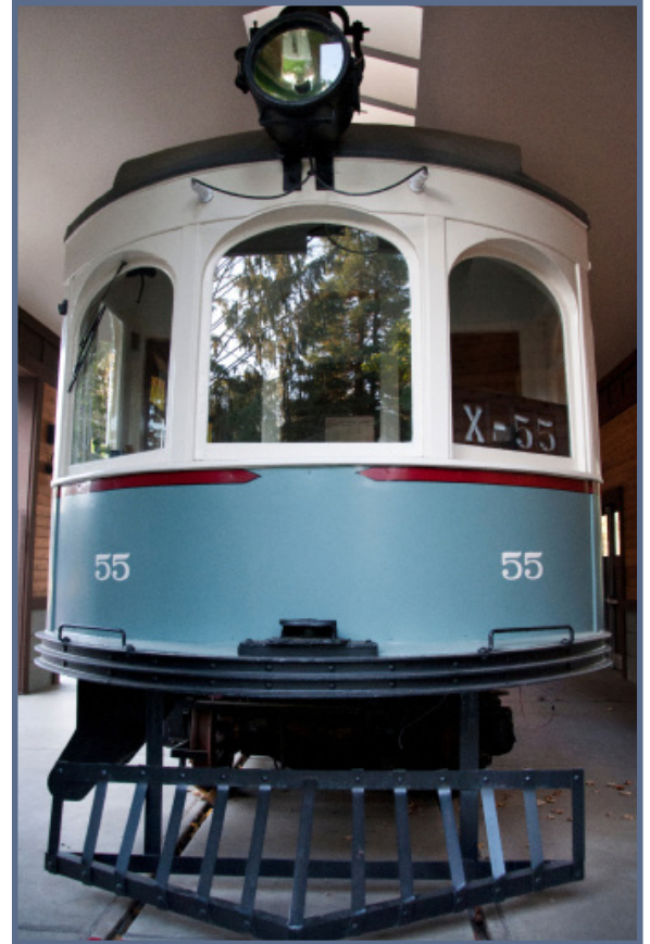
Interurban Car #55

Advocate to preserve nature, parks, sites, buildings, and artifacts, and for City policies and legislations that are informed by an understanding of history and heritage.