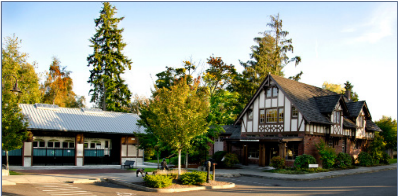
Trolley Barn & Wickers Building, Heritage Park

The Heritage Plan is a strategic framework and planning document that guides the City's effort to reflect, honor and carry forward the community's history, heritage and culture.