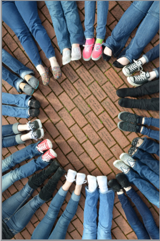
Memorial Brick Plaza

Collaborate with community partners to collect and promote the history and heritage of Lynnwood.