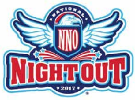
POLICE . COMMUNITY PARTNERSHIPS

The Lynnwood Police Department, in partnership with the Family Center of South Snohomish County, the Lynnwood Fire Department, and other city departments, encourages residents to organize a neighborhood event to bring neighbors together.