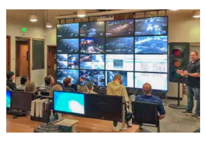
Above: Lynnwood University students tour the Traffic Management Center

For more info, or to register for Lynnwood University visit www.LynnwoodWA.gov/LynnwoodUniversity or call 425-670-5023