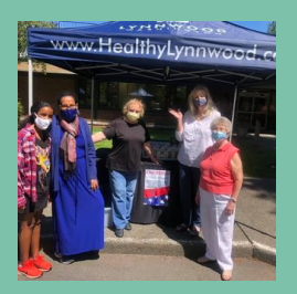
Fairs and Festivals: in-person community outreach at local events