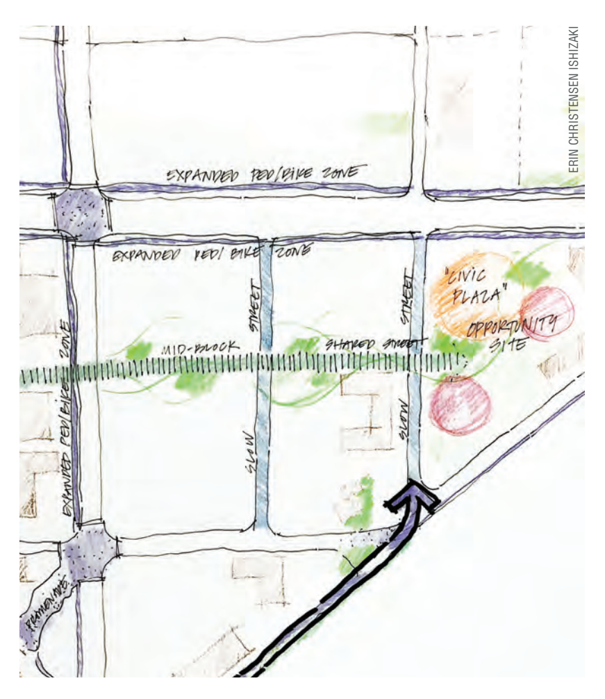
The experts recommend that the city focus on a series of smaller public spaces along 198th Street and a new 42nd Avenue (center of diagram).

The experts know that a primary component of the City Center project is a new central gathering space. Concurrent with recommendations regarding right-of-way improvements to make getting to destinations within and around City Center more pedestrian and bicycle friendly, the experts recommend thinking about the different types of civic gathering spaces that could be created along these routes, rather than one primary space. The city has already identified potential parcels where a new central park could be located. The experts suggest that after looking at some route configuration and pedestrian-friendly improvements that are identified in the graphic on page 17, a good location for a central park is around the new intersection of proposed 42nd Avenue and the reconfigured 198th Street promenade. The experts note that—rather than try to create a larger "central park"—a one- or two-acre park in this location, with areas for people to gather and relax, with green space, and with small park amenities, would be a place people in this area would naturally gravitate toward. A park of this size would help complement some of the other new uses in the area, such as businesses, restaurants, and housing.