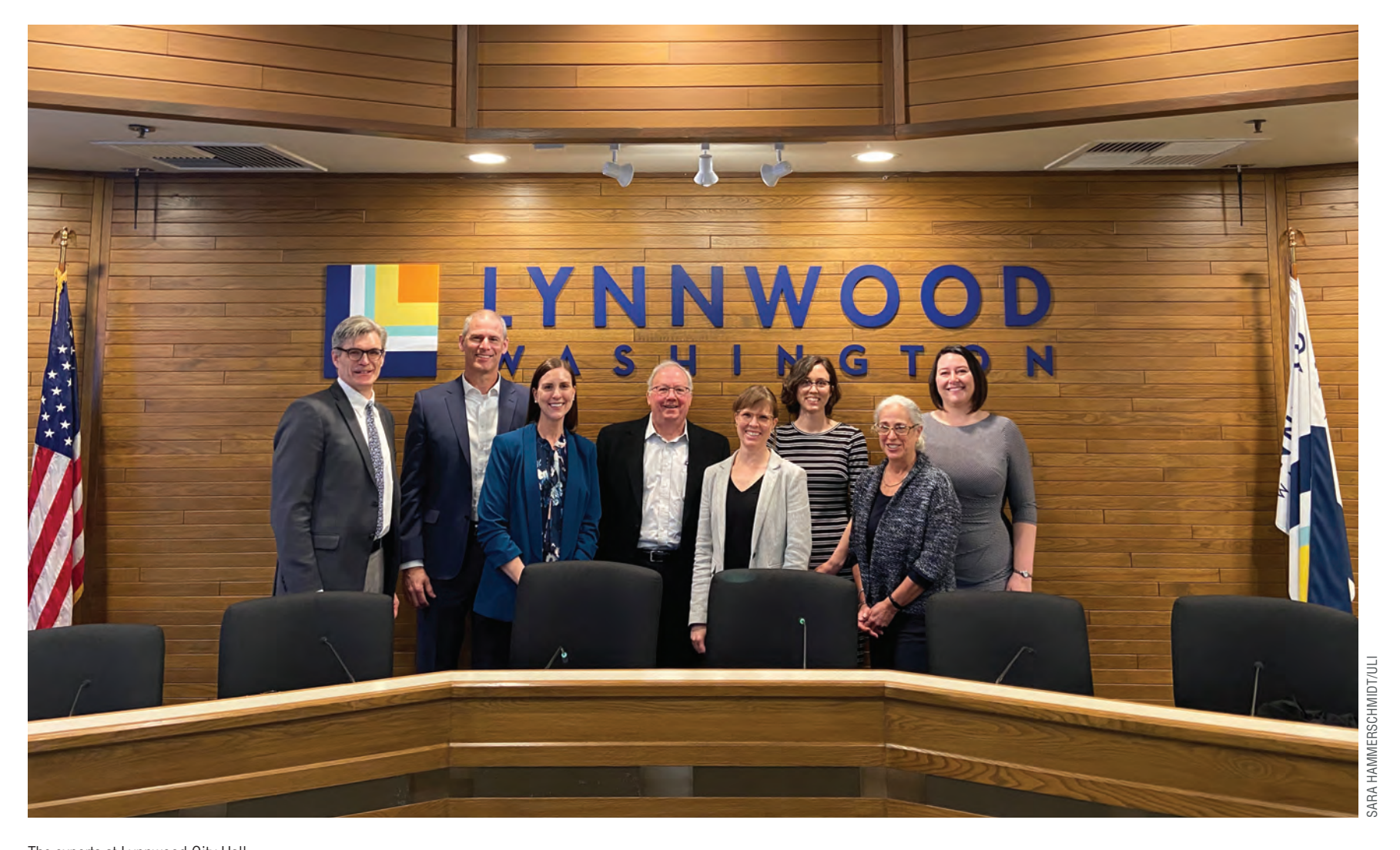
The experts at Lynnwood City Hall.