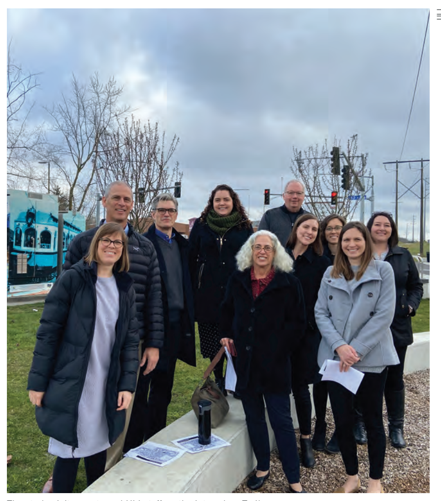
The study visit experts and ULI staff on the Interurban Trail.