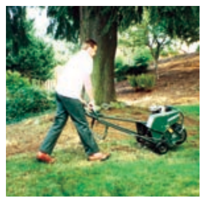
You can rent an aerator, or get a yard service to aerate for you.

Accept a few weeds, and crowd out problem weeds by growing a dense healthy lawn. Use a long handled weed puller to easily remove dandelions without bending over. Weeding is easiest when the soil is moist. If you want to use weed killer, don't spread "weed and feed" all over (it gets into our streams) – just spot spray the problem weeds.