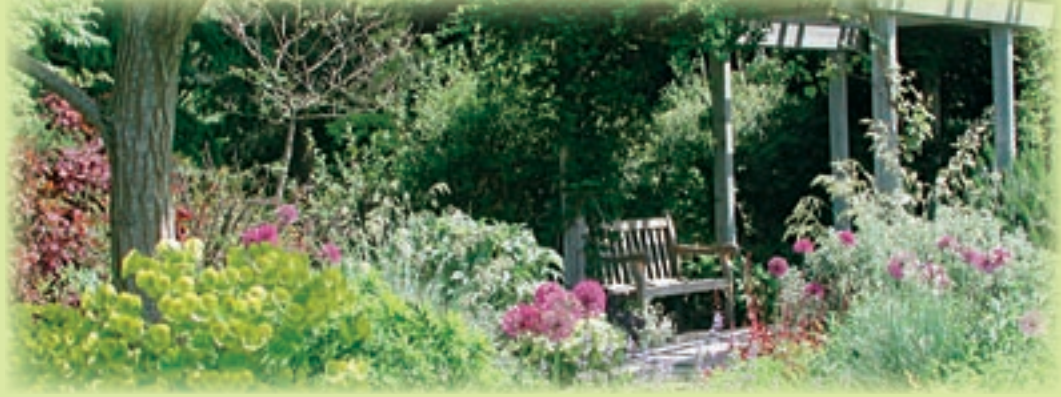
Printed on recycled paper