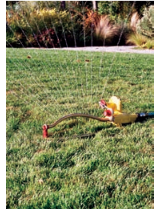
Water in early morning or evening to reduce evaporation.

• Adjust the watering schedule at least once a month through the season – plants need a lot less water in May and September than they do in July and August.