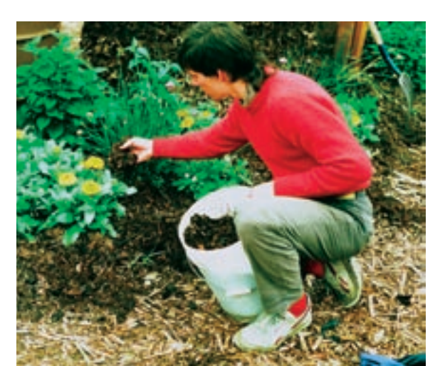
Mulch stops weeds, conserves water, and builds healthy soil for healthier plants. Spread mulch several inches deep and 1 inch away from plant stems.

Most trees and shrubs can get all the nutrients they need from the soil, and mulching once a year. But annual plants, vegetable gardens, and lawns sometimes need extra nutrients. When shopping for fertilizers, look for the words "natural organic" or "slow release" on the bag. Unlike "quick release" fertilizers, natural organic fertilizers won't wash off into streams so easily, and they'll feed your plants slowly to keep them looking good longer.