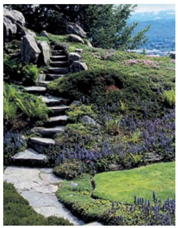
Pick plants that resist pests and use less water.

Select plants that grow well in the Northwest and fit the sun, soil, and water available in your yard. Native plants are best near waterways, and also work well on many other sites. Think about how big a tree or shrub will be when mature (especially next to houses or under powerlines). Look around at neighbors' yards, nurseries, books, and demonstration gardens for plants that do well in sites similar to yours.