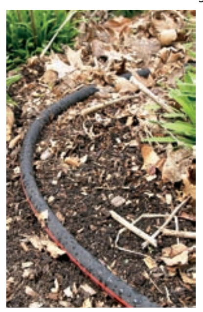
Soaker hoses save water! Cover them with mulch to save even more.